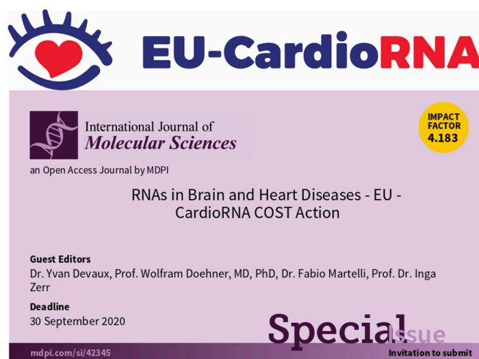
Figure 2. Banner of Special Issue “RNAs in Brain and Heart Diseases - EU-CardioRNA COST Action”.

Through the Special Issue “RNAs in Brain and Heart Diseases” in International Journal of Molecular Sciences ( https://www.mdpi.com/journal/ijms/special_issues/rna_brain_heart_cost ), members of the EU-CardioRNA COST Action CA17129 aim to provide a forum for reporting and discussion on the topic of RNAs in brain and heart diseases, focusing on organ interactions and common mechanisms between diseases. The banner is showed as Figure 2. The Special Issue specially welcomes regular research articles or review articles focusing on brain disease affecting the cardiovascular system or heart disease affecting the neurological system.